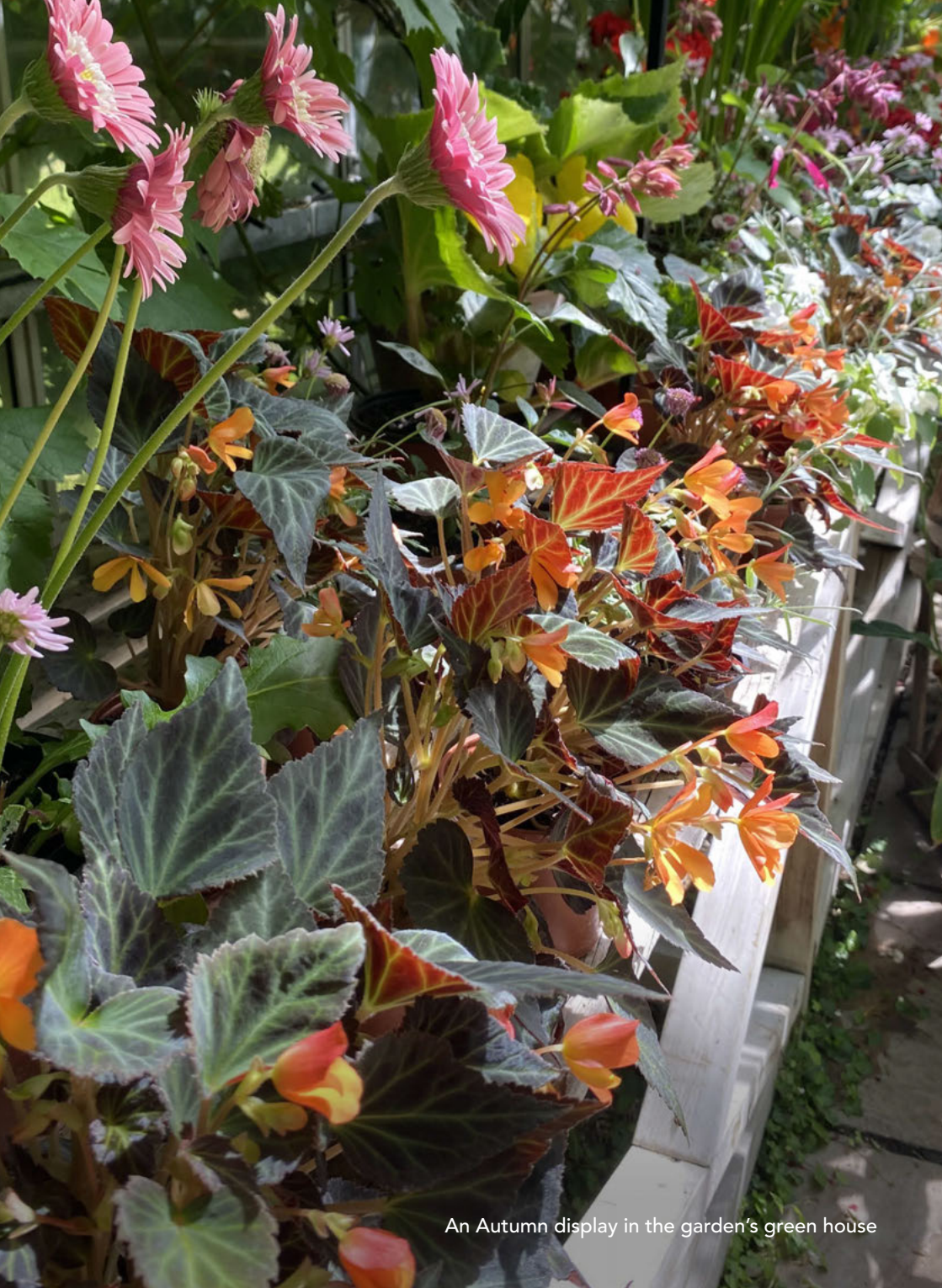
An Autumn display in the garden's green house

Book online at westgreenhouse.co.uk or call 01252 844611